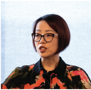
GRACE TAM CLEAN ENERGY FINANCE CORPORATION